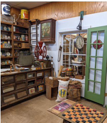
EXHIBIT SPOTLIGHT: GENERAL STORE

While there isn't a "before" picture included, many can remember the general store before it got a thorough reorganization and cleaning out. Now, visitors can walk in the store, look around and the items "for sale" and even play a game of checkers with a friend. This is part of our initiative to include more interactive areas for children and adults of all ages. Come into the museum to see more interactive displays!